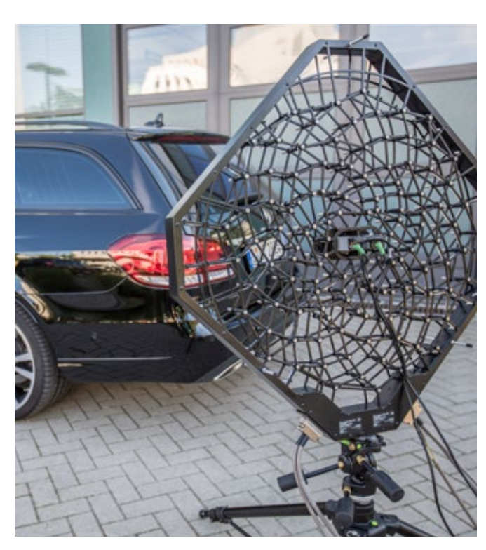
Fibonacci array measurement set up