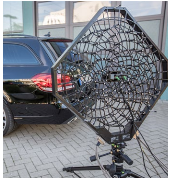
Fibonacci array measurement set up