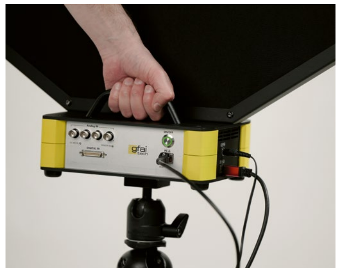
The Octagon can be placed on the ground or on a tripod

The fiber-carbon construction makes the Octagon stable and light at the same time, integrated handles allow for easy transport. All these features make the Octagon the perfect system for a wide range of applications in R&D, quality assurance, maintenance or environmental acoustics.