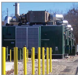
Diesel gensets with a combined SCR & Diesel Oxidation Catalyst package

The right fit for any system, the MIRATECH catalyst comes in a wide variety of shapes and sizes to match a wide range of engine sizes, applications, catalyst system requirements, and budgets... The final system selection will be based on specific air regulations. To determine the correct MIRATECH housing, choose the right Catalyst Formulation, Substrate Configuration, Sound Attenuation and Horsepower Range. Match the horsepower with the right MIRATECH housing. Next contact MIRATECH Sale or specify the project at the www.miratechcorp.com Emissions Solutions Guide.