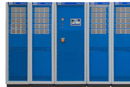
Amplifier (Illustration similar)