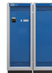
Field power supply