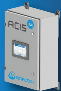
Next Gen Controls

ENGINEERED TO PERFORM™ +1 800-640-3134 | MIRATECHCORP.COM