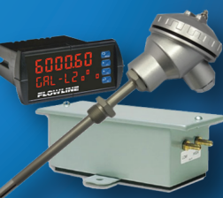
Full Sensor Suite